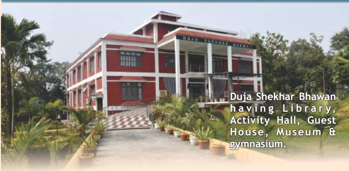
Duja Shekhar Bhawan having Library, Activity Hall, Guest House, Museum & gymnasium.