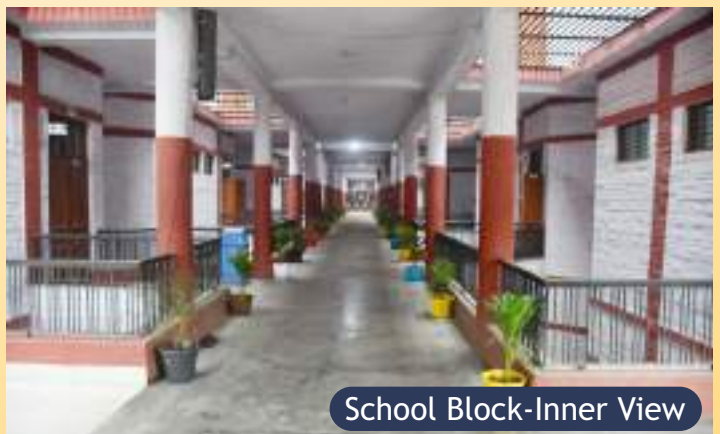
School Block-Inner View