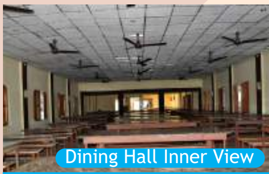
Dining Hall Inner View