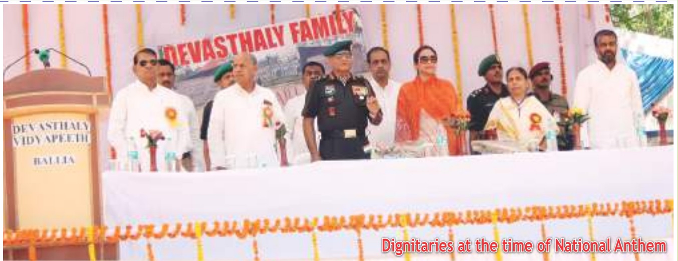
Dignitaries at the time of National Anthem