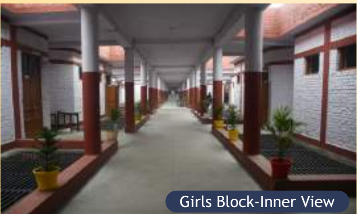
Girls Block-Inner View