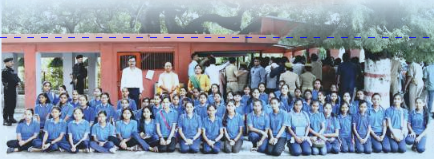
With C.M Yogi Adityanath during educational tour.