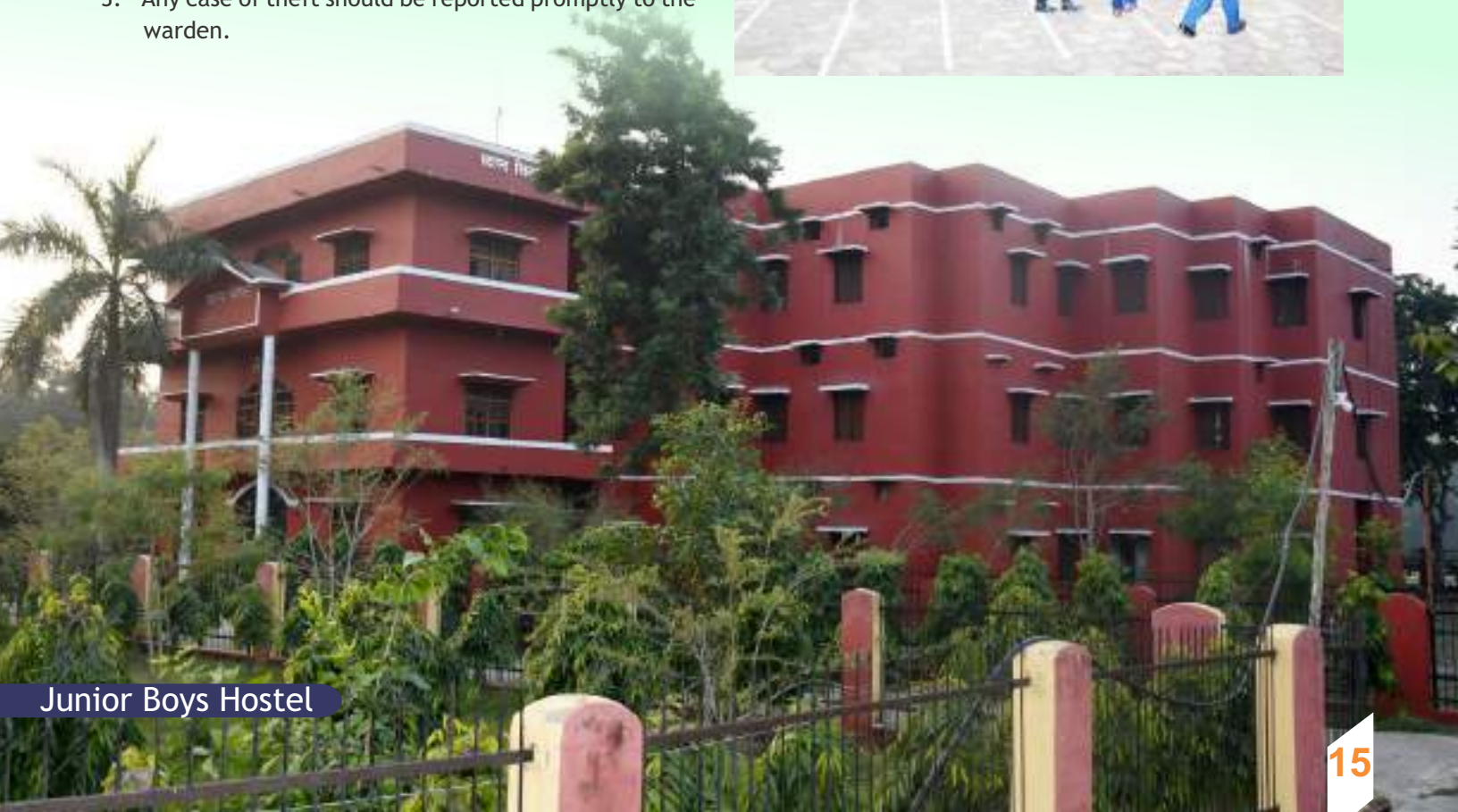
Junior Boys Hostel