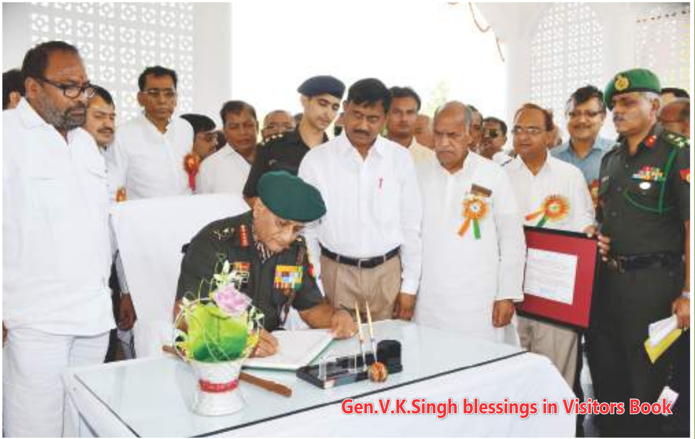
Gen.V.K.Singh blessings in Visitors Book