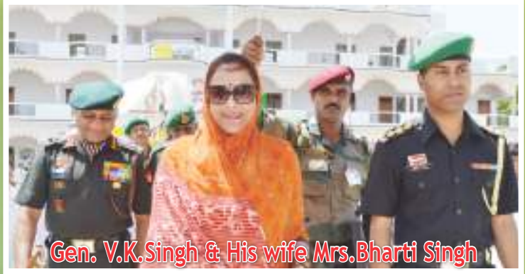
Gen. V.K.Singh & His wife Mrs.Bharti Singh