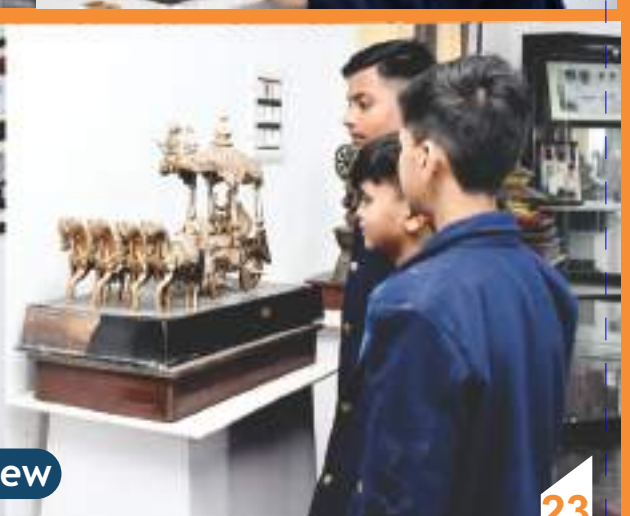
Museum inner view