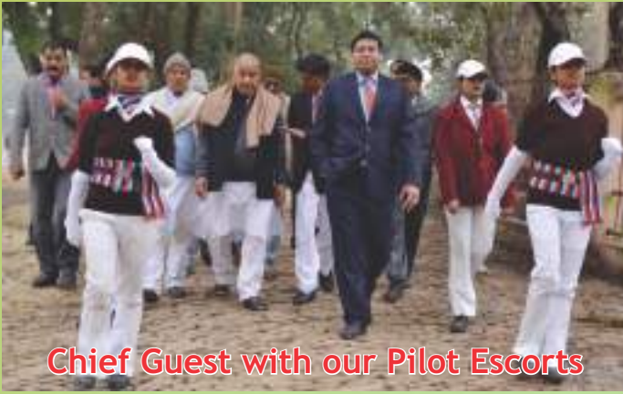
Chief Guest with our Pilot Escorts