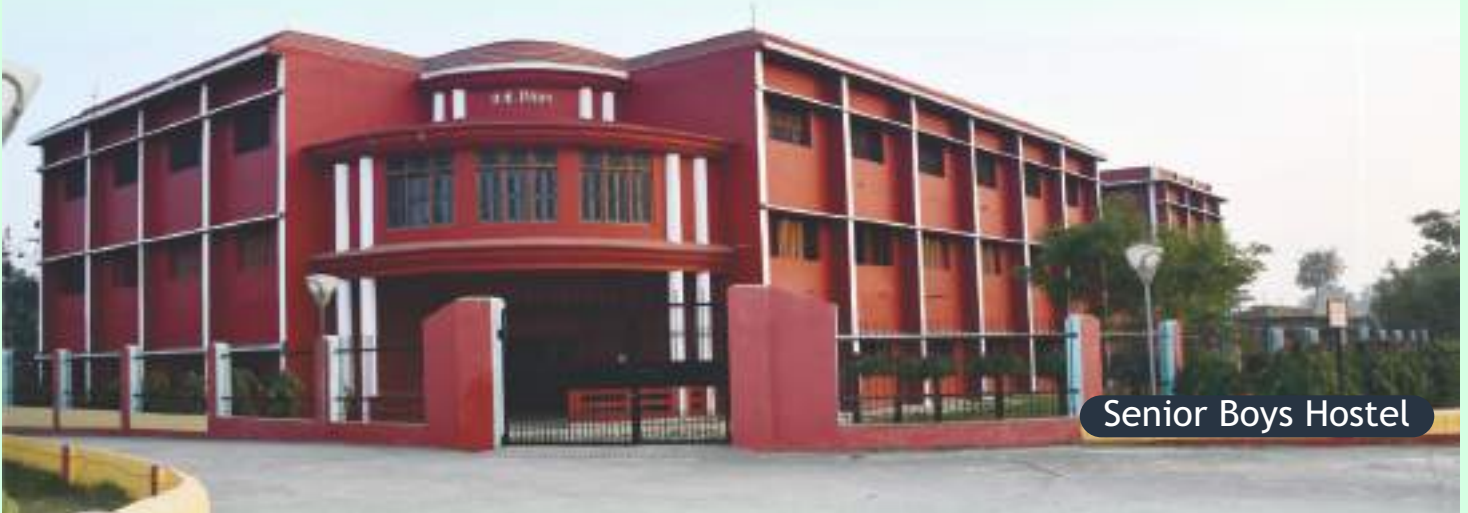
Senior Boys Hostel